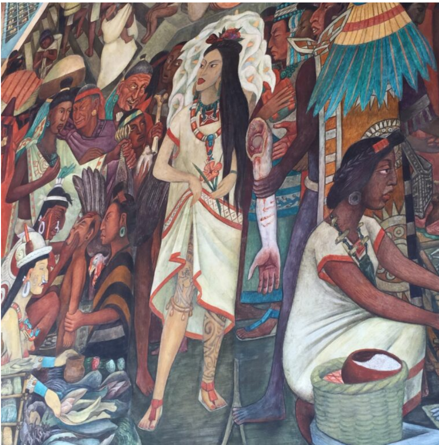
Frida Kahlo in another Diego Rivera mural in Mexico City