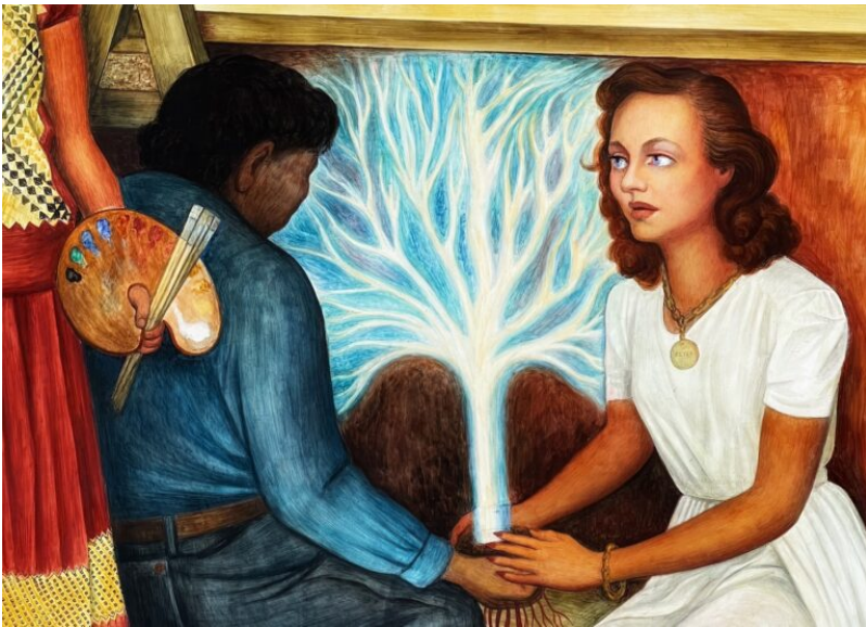
Diego Rivera and Paulette Goddard (Charlie Chaplin's wife) in the mural

Diego Rivera and Frida Kahlo are artistic favorites of ours. We visited Kahlo's famous "Casa Azul" (Blue House, which is both her former dwelling and now a museum) when we were in Mexico City in 2015.