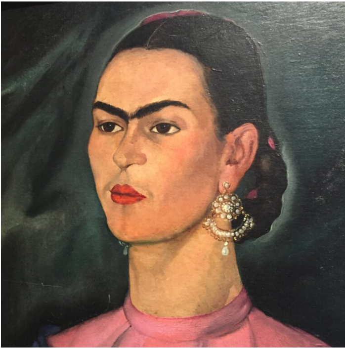
Frida Kahlo portrait hanging in her "Casa Azul" Mexico City