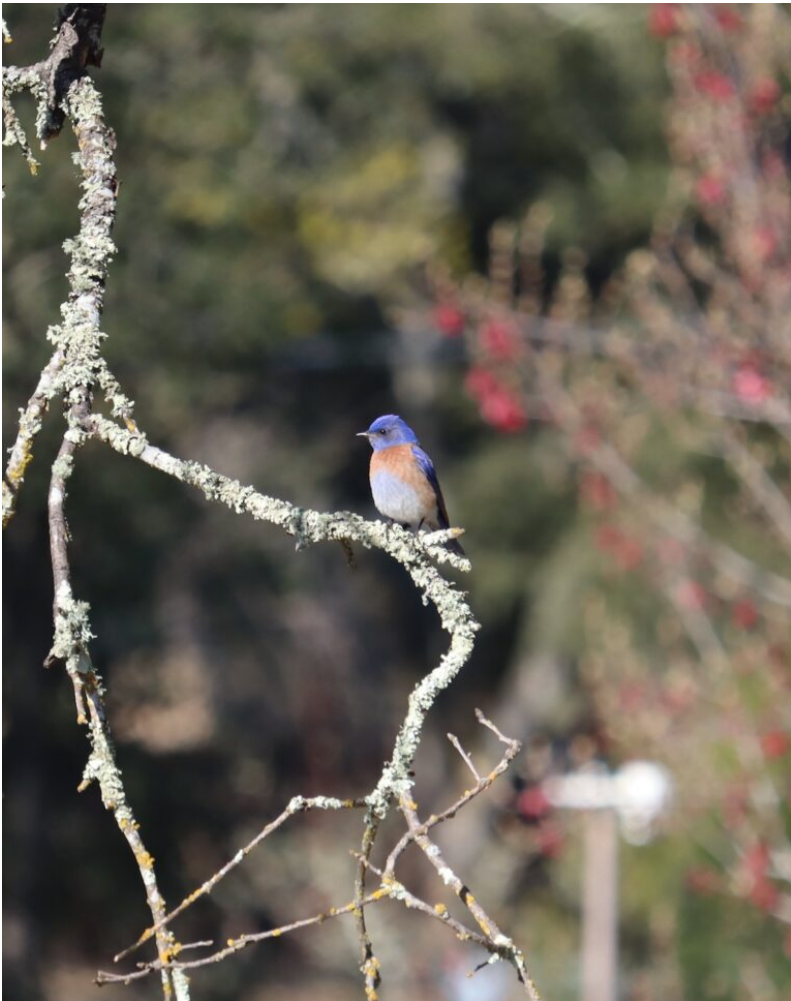
Lazuli bunting

We already posted springtime photos taken in and around 223 Bonnie Way in Glen Ellen, California, the place where we moved in January of this year.