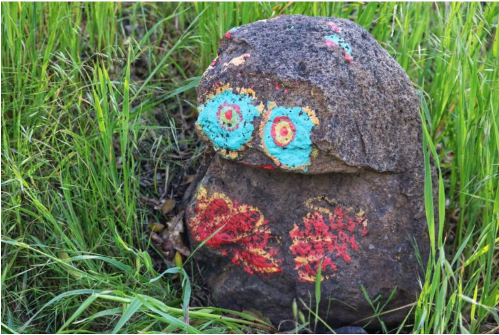
Whimsical artifact, in situ