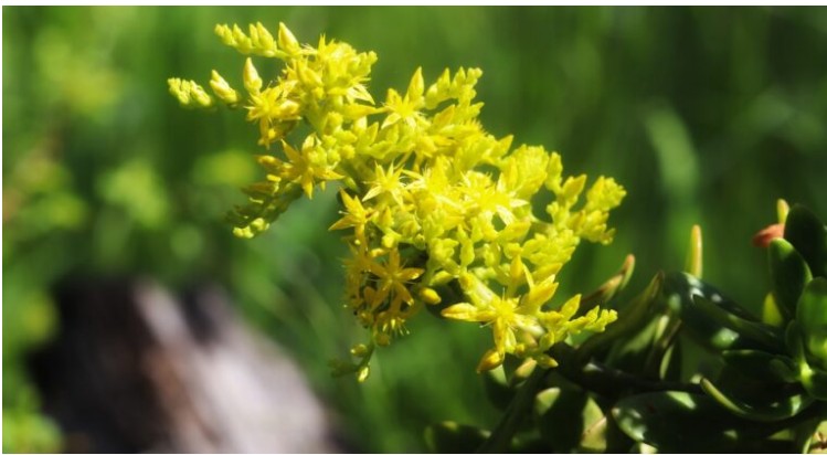
Yellow sedum flowers (by Anna)

◀ 2023 ▶ 223 BONNIE WAY ▶ ARTIFACT ▶ CALIFORNIA ▶ FLOWER ▶ GLEN ELLEN ▶ SPRING