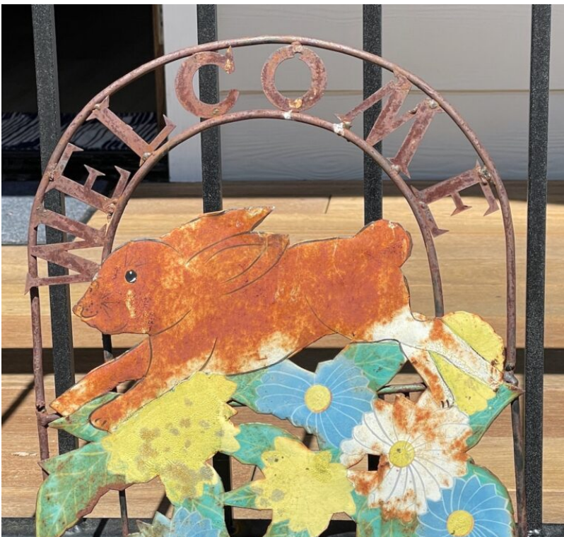
Artifact from the back yard, in honor of the Easter season, and a reminder of all that was lost in the fire of 2017

Here are more of our recent pictures in both categories.