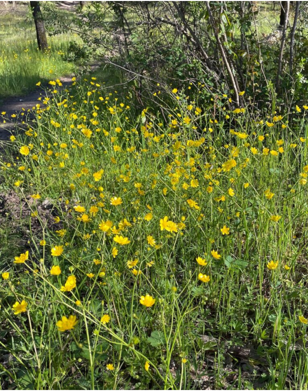
Field of buttercups (by Dick)