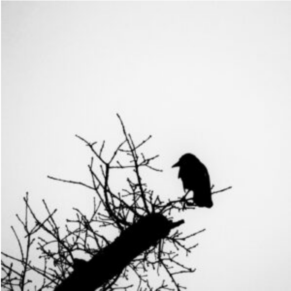
Crow on an oak branch