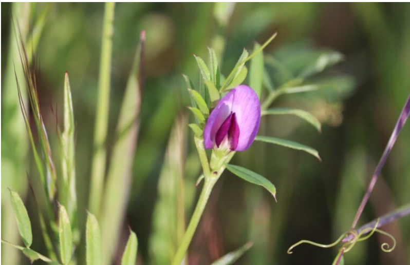
Purple pea flower (by Anna)