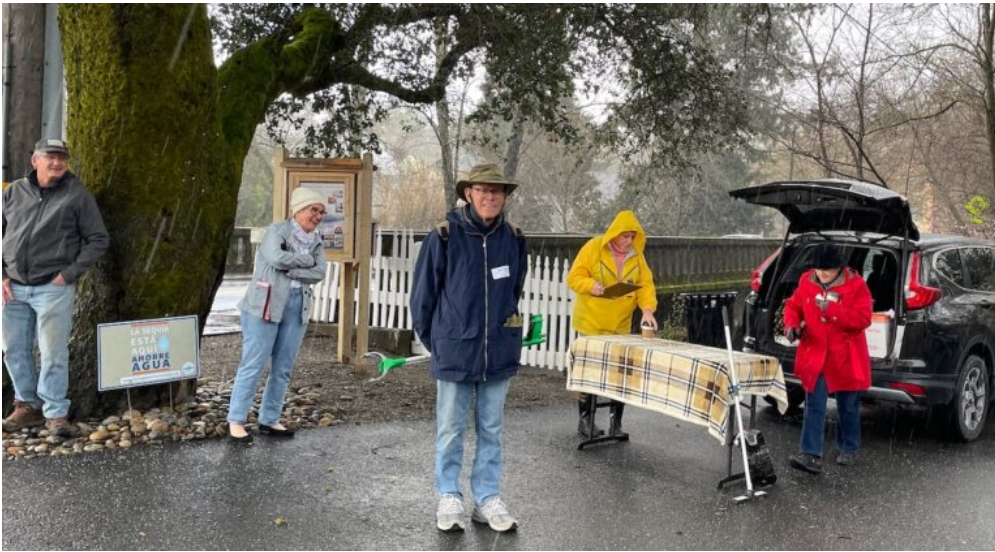
Some of the trash picker-uppers