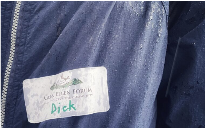
Besides spiffing up the town, it would have been a good opportunity to meet more of our new neighbors

We met at the place where Sonoma and Calabazas Creeks meet. For a few minutes hail covered everything.