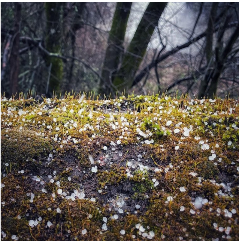
Hail on the bridge over Sonoma Creek

This morning a group of Glen Ellen community-minded citizens got together by the bridge over Sonoma Creek to pick up trash. Alas, we had been there no more than 10 minutes, and were just getting organized, when another of our frequent hail storms passed by and drenched us all!