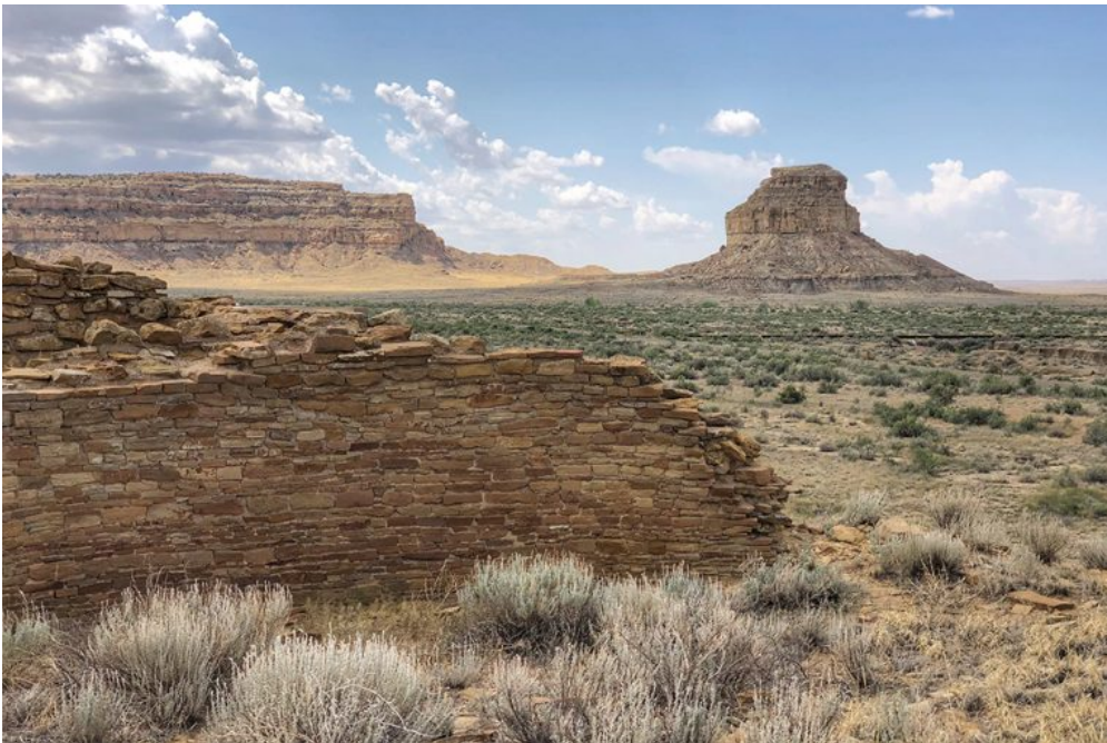
Chaco Canyon, Colorado