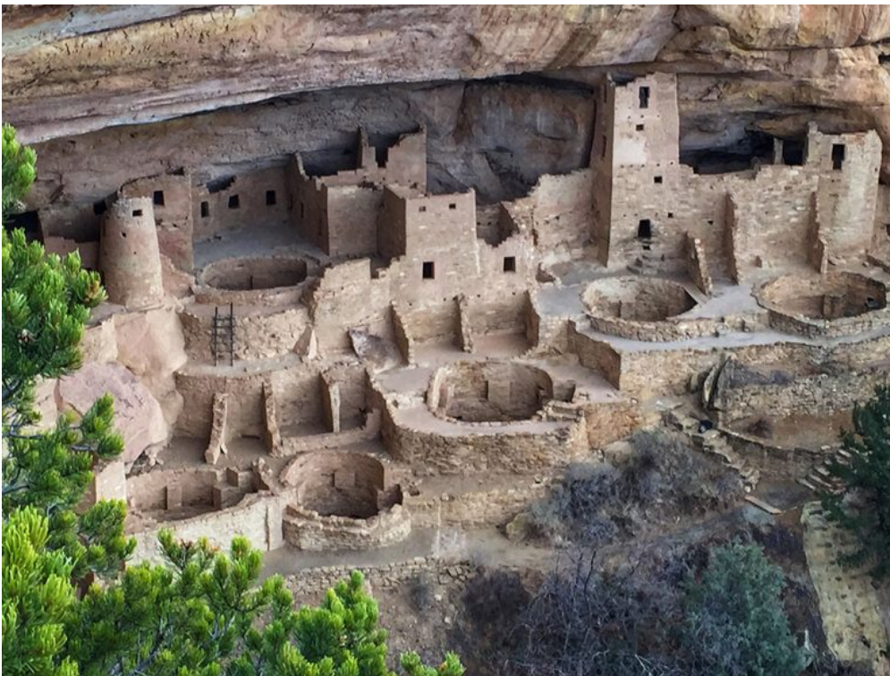
Mesa Verde, Colorado

I'd like to start with travel, which has been a life-long passion for both of us. We love experiencing new people and places, as well as revisiting favorites from the past.