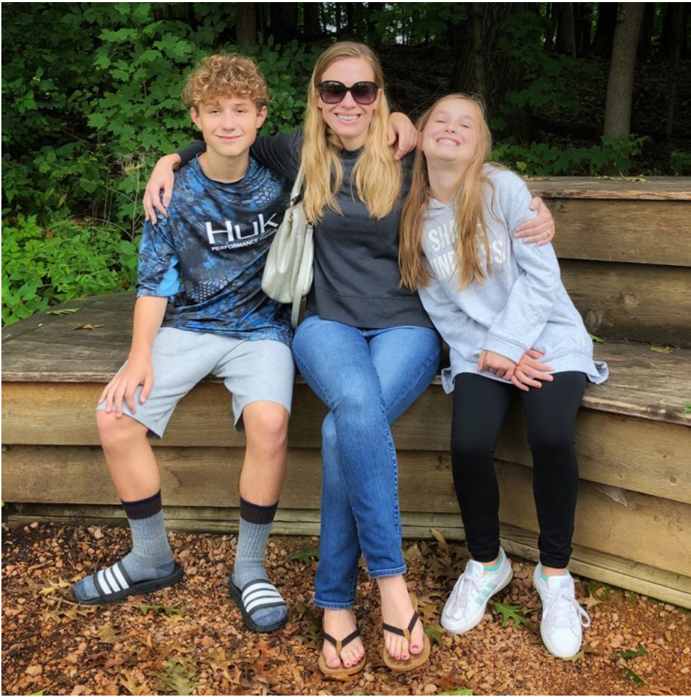
Blomquists at the Minnesota Landscape Arboretum