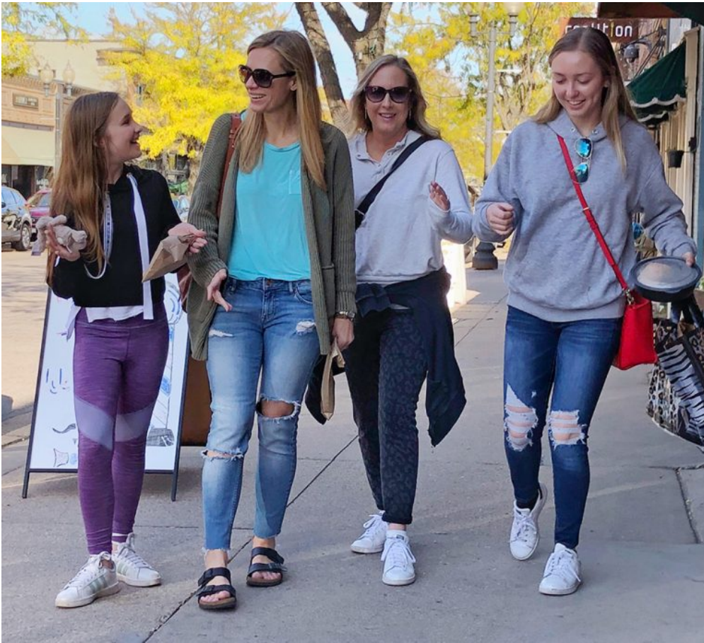
Family in Excelsior, Minnesota

We also did a trip in February to Roots Tech, a genealogy conference in Salt Lake City. It was also a repeat experience for us, and we appreciated learning new tips on doing our family history, which continues to be a major hobby for both of us.