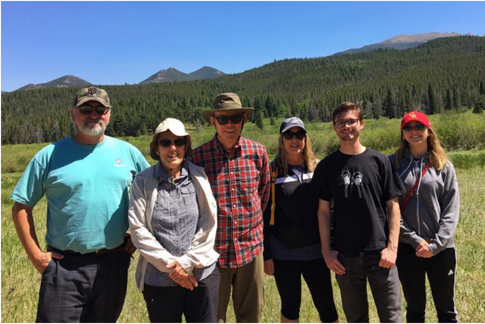
Hiking in Rocky Mountain National Park

done four similar trip to Cortez, Colorado, and all have been wonderful experiences.