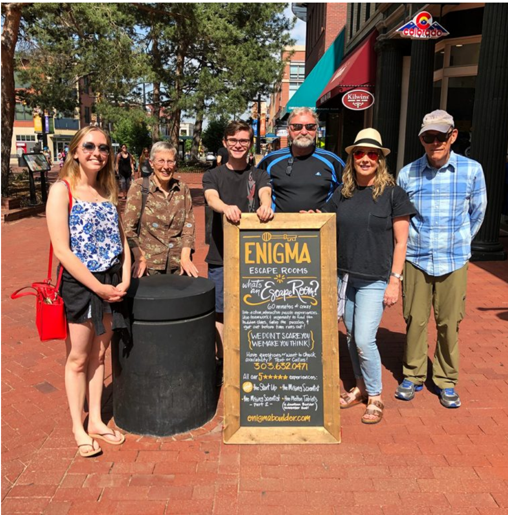
Family in Boulder, Colorado

The trips to Minnesota were in August (only Dick and I) and October (when Ellen joined us and Miranda put in a super-surprise appearance for a few days). The Blomquists have been hosting four foster kids since the late spring, so we stayed in a bed and breakfast (Bird House Inn) in the lake town of Excelsior. What a charming little place, and so close to shopping, restaurants, and walking along Lake Minnetonka.