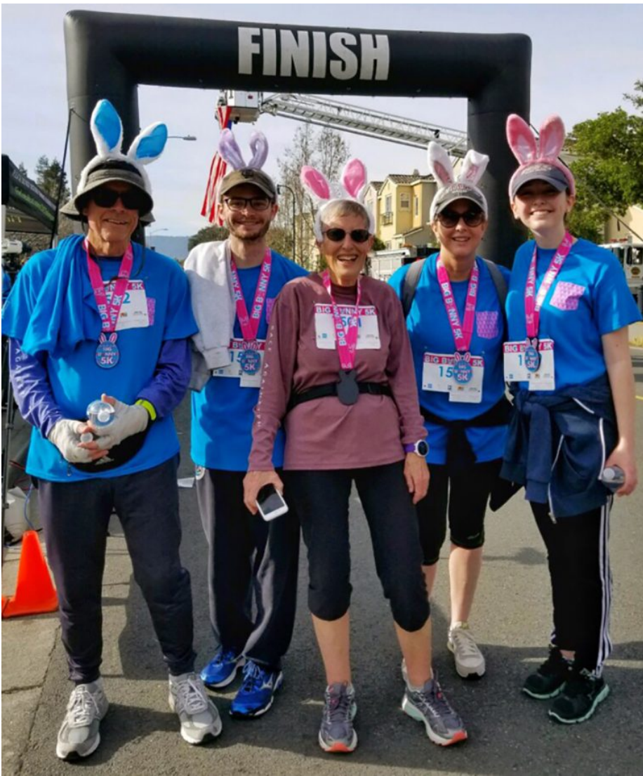
Family at the Big Bunny 5K