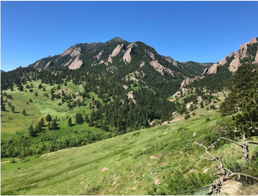
Flatirons near Boulder, Colorado

I'd like to start with travel, which has been a life-long passion for both of us. We love experiencing new people and places, as well as revisiting favorites from the past.