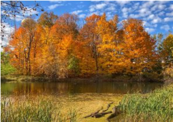
Fall colors in Minnesota

It's always fun for me to look over what we've done over the past year in preparation for writing this highlights post – I'm always amazed at how many places we've gone and things we've done. We consider ourselves lucky that it's all been possible!