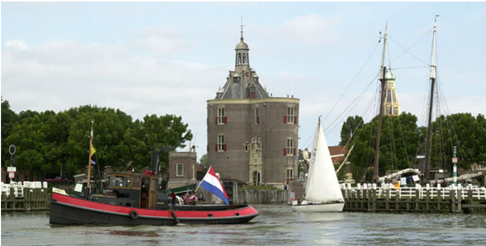
The port of Enkhuizen in modern times