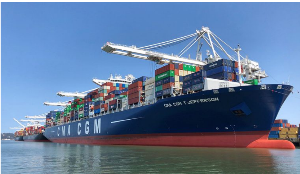
CMA CGM T. Jefferson

According to marinetraffic.com, CMA CGM T.Jefferson left the Port of Oakland on 12 Aug 2018 at 6:00 a.m. and headed in a northwesterly direction in the Pacific Ocean.