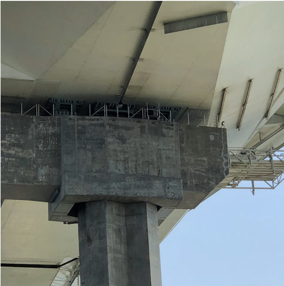
Do you see the (Bay) bridge troll?