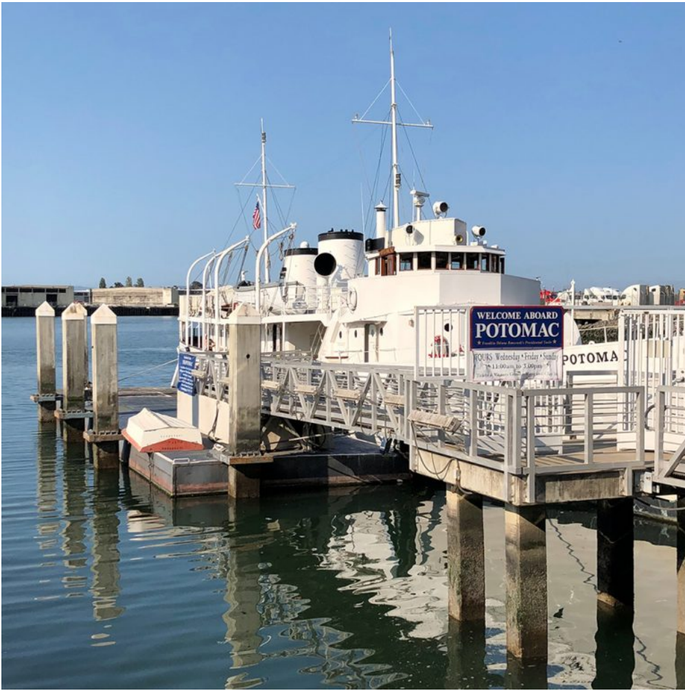
USS Potomac at the dock