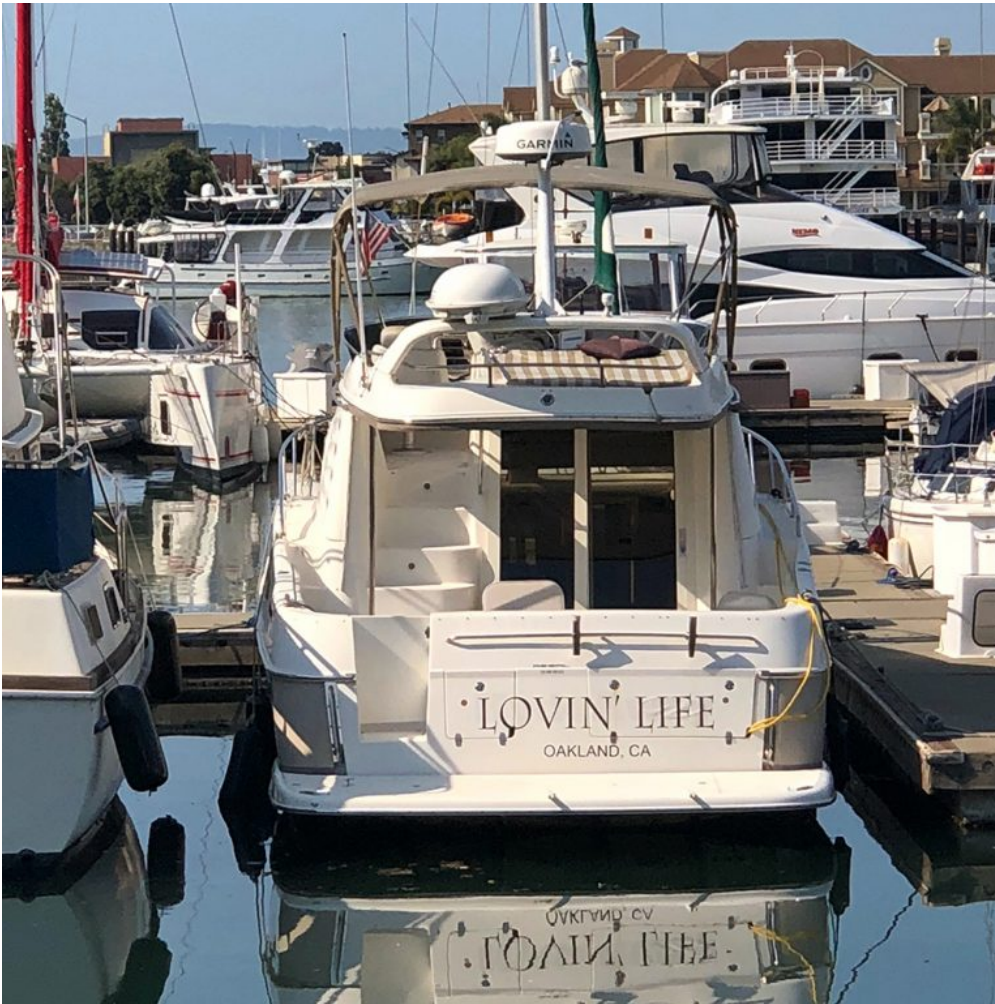
An aptly named boat ("rhymes with" Livengood?)

Fortunately, our tour ended more successfully than the one on Gilligan's Island! It was a beautiful day to be on the water, and we took photos of some of the container ships and the Golden Gate and Bay bridges.