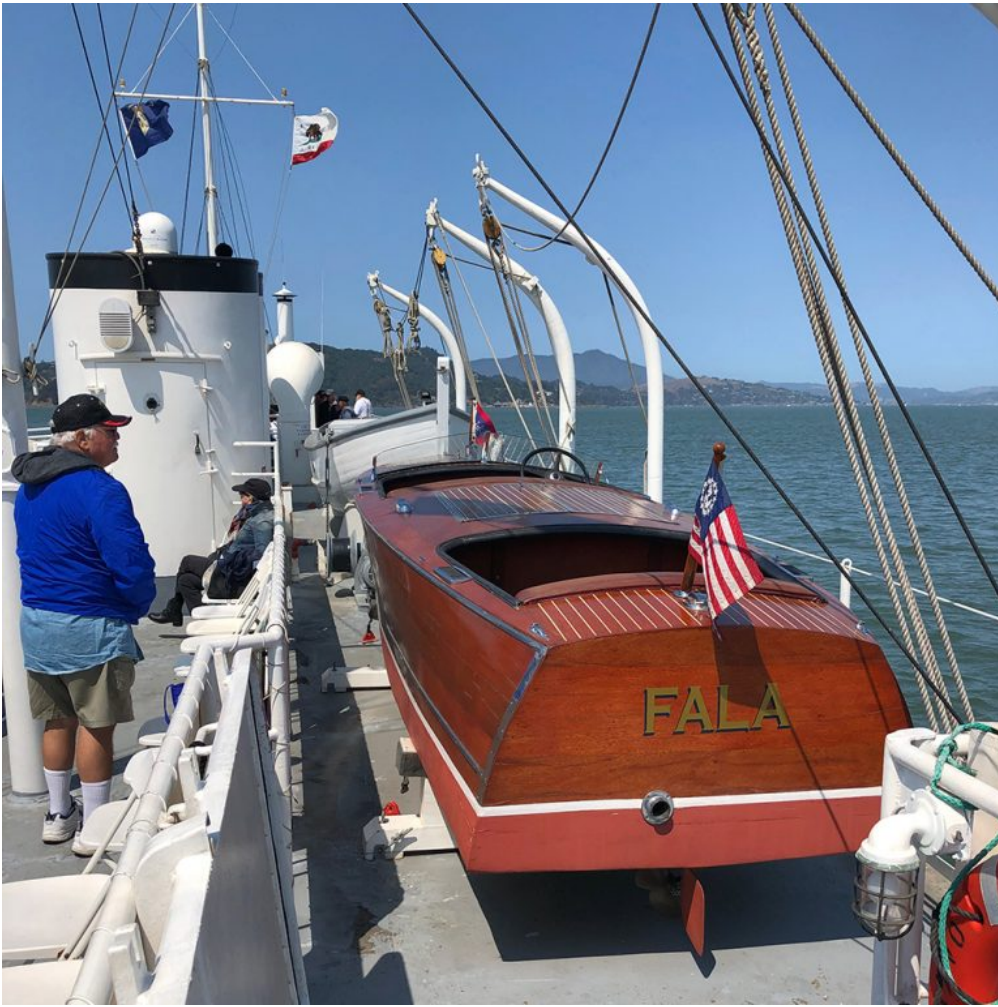
Fala was FDR's dog