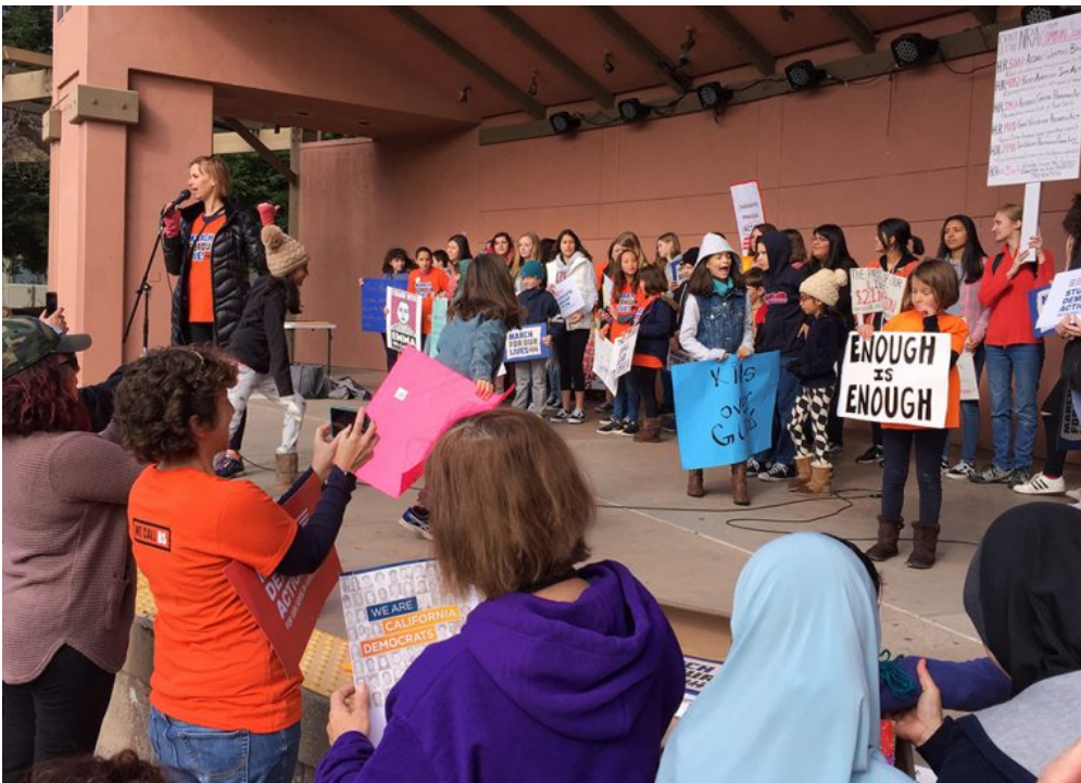
Students on stage at the Morgan Hill Community Center

We were pleased to see the large number of people who participated, and we were glad to be able to add our voices to a call for immediate and effective action by the people we have elected to create and enforce laws that will keep us, our children, and grandchildren safe, and to maintain a peaceful, strong, and civil society.