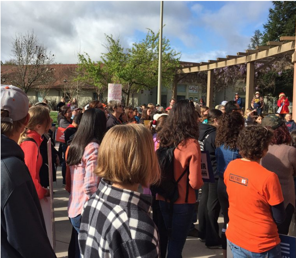
Crowd at the event