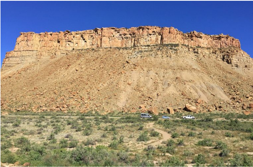
Travel vans in the Ute Mountain Tribal Park