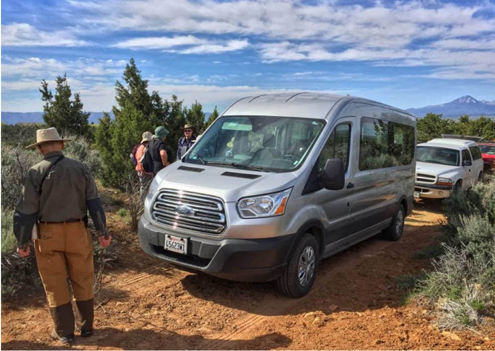
Vans parked in the survey area

The survey took place on private property in the Dolores, Colorado, area. Two groups of about 6 people each spread out in a line and “transected” several predetermined plots of land, flagging relevant items as we walked. We wrote up the areas that were “thick” with artifacts, in preparation for a detailed scientific paper to be written at some point in the future. The data and papers will be made available to researchers on the Internet.