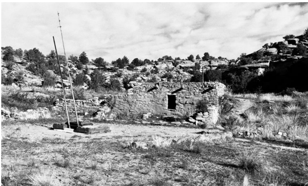
Restored kiva at Kelly Place