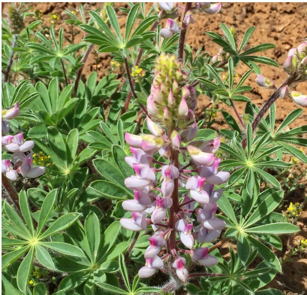
The cactuses weren't quite in bloom yet, but the lupines were spectacular

Diane holding a Mancos Black-On-White sherd from about 1000 A.D.