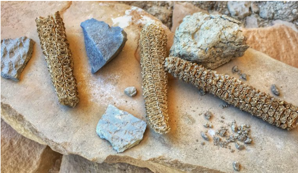
Corn cobs and other artifacts from the cliff dwellings