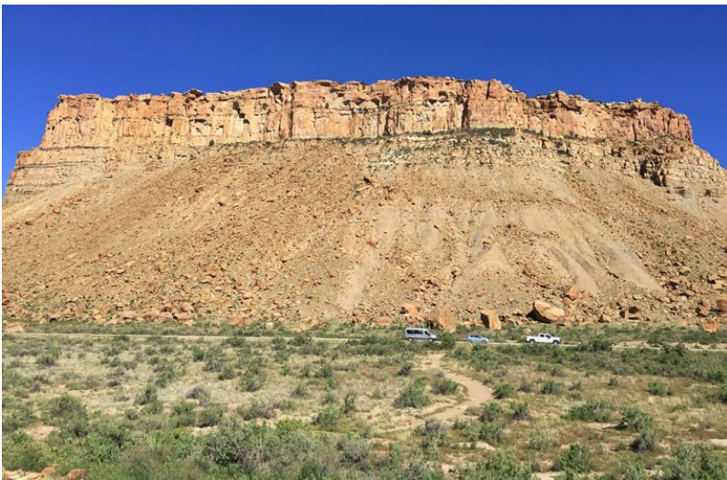
Travel vans in the Ute Tribal Park

From April 16-22, 2017, we joined an archaeological survey group (sponsored by Road Scholar) in the Four Corners area (where Utah, Colorado, Arizona, and New Mexico come together) to look for artifacts associated with various ancestral Pueblo (Anasazi) peoples. The survey involved stumbling up hills and down creek beds, and tripping over logs and sagebrush bushes, to search for pottery sherds and hand tools. Our group consisted of 11 people from all over the United States. We all had a lot of fun!