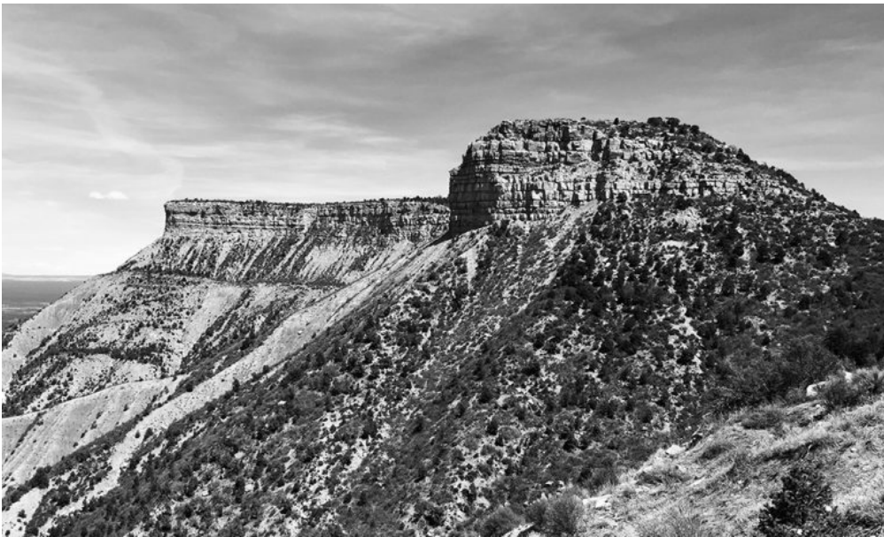
Buttes in Ute Mountain Tribal Park