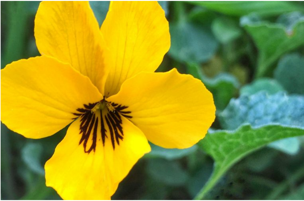
Yellow violet along the trail

◀ 2017 ◀ CALIFORNIA ◀ HIKING ◀ JOHNSON ◀ SAN JOSE ◀ THE VILLAGES ◀ VAN RAAPHORST