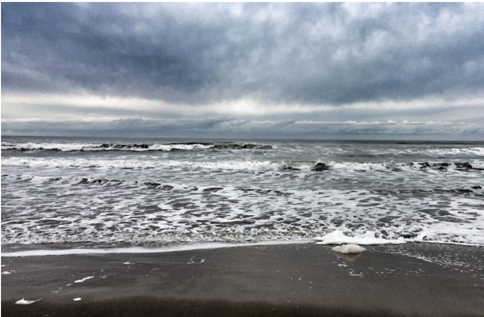
Waves at Pismo Beach