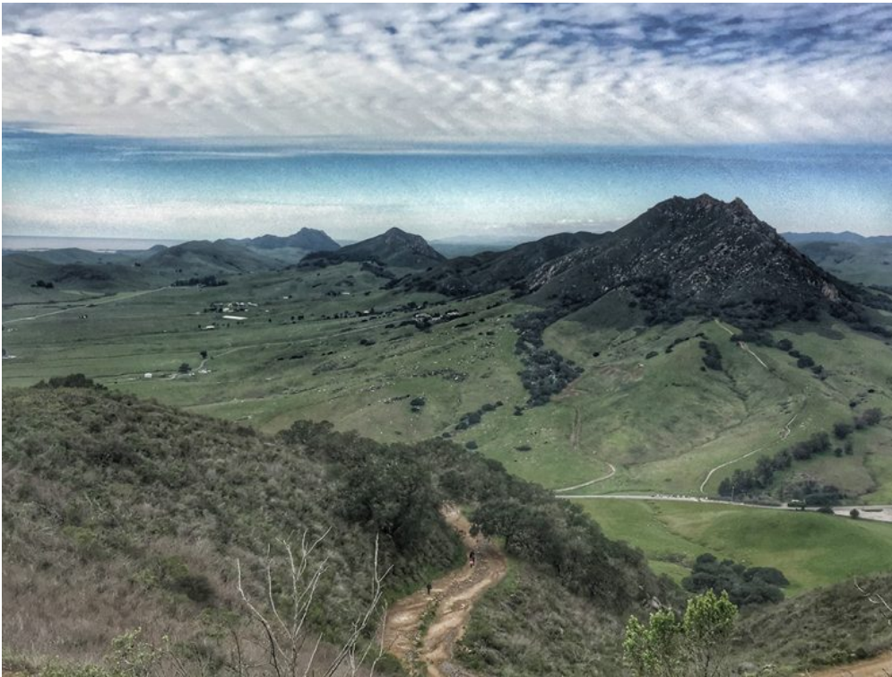
Bishop Peak and the other "Seven Sisters" from Cerro San Luis