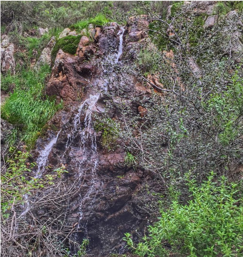
Waterfall on Cerro San Luis