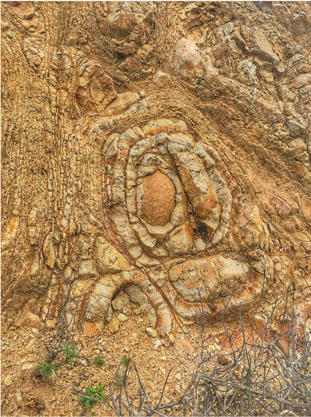
Volcanic rock on Cerro San Luis