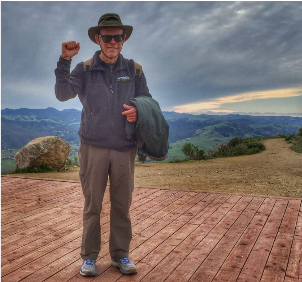
We made it to the top!