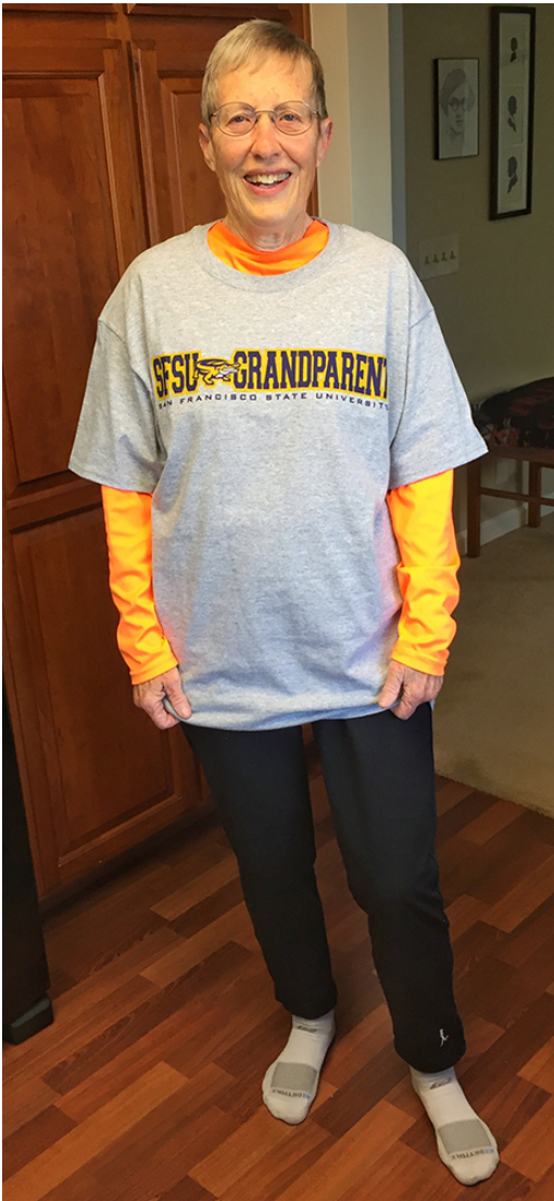
Going running Christmas Day. Proud to be an SFSU Grandparent!