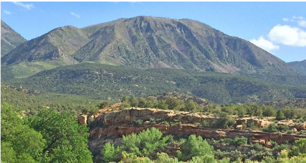
View from Kelly Place

In May 2016 Dick and I did a “hiking to ruins” Road Scholar trip in the Four Corners area (the place where Utah, Colorado, Arizona, and New Mexico come together). We flew in to Durango and stayed there overnight, and the following day we drove to Cortez, Colorado, where we stayed in a wonderful bed and breakfast called Kelly Place, which features a gorgeous location, wonderful food, and a cat named Cookie Dough.