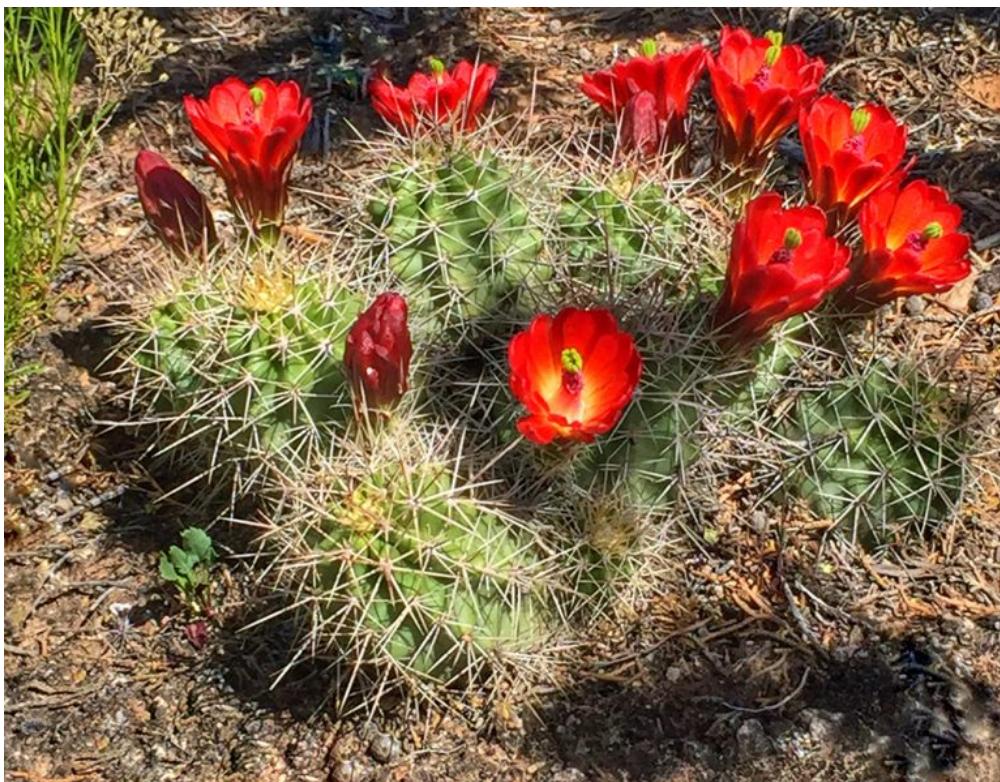
Claret Cup cactus in bloom