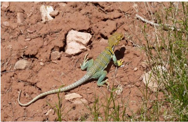
Green Collared lizard

In May 2016 Dick and I did a “hiking to ruins” Road Scholar trip in the Four Corners area (the place where Utah, Colorado, Arizona, and New Mexico come together). We flew in to Durango and stayed there overnight, and the following day we drove to Cortez, Colorado, where we stayed in a wonderful bed and breakfast called Kelly Place, which features a gorgeous location, wonderful food, and a cat named Cookie Dough.