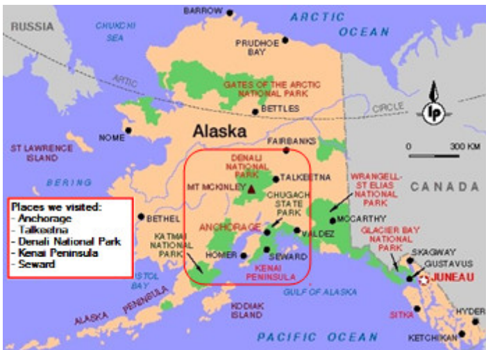
Places we visited in Alaska

From May 28 to June 11, 2015, we participated in a Road Scholar trip to the South-Central part of Alaska.