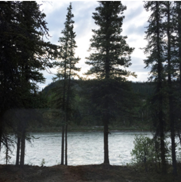
View from our cabin window at the Denali Education Center