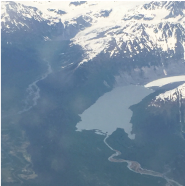
Melting glacier from the air

Our group consisted of 20 people. Our activities mostly involved hiking, boating, photography, and education. Particularly interesting to us were discussions about the wildlife and their ecosystems. The photo below of a receding glacier, taken on our flight in to Anchorage, symbolizes the many environmental challenges we heard about and observed for ourselves.