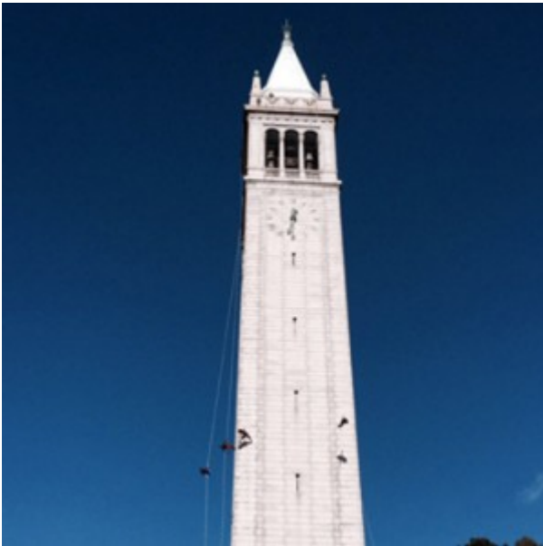
UC Berkeley campanile with ballet dancers