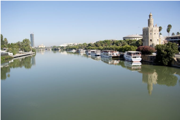
Seville: Guadalquivir River