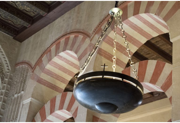
Cordoba: Mosque built on a Christian church