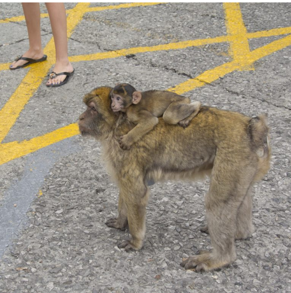
Gibraltar: Macaque Apes