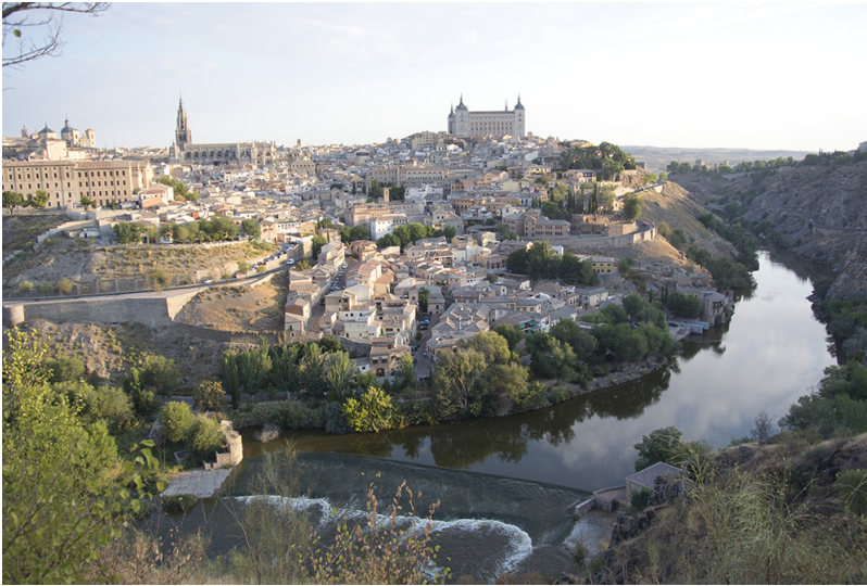
Toledo, Spain - Tajo River

In September 2012 we took a Road Scholar trip to Spain and Morocco. This post covers Spain; another post covers Morocco.