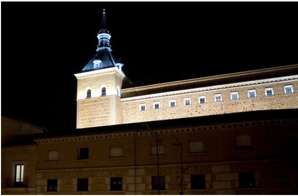
Toledo: Alcazar at night