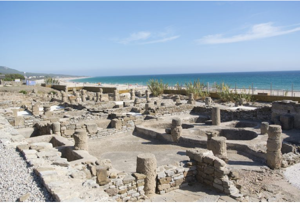
Gibraltar: Baelo Claudia Roman ruins