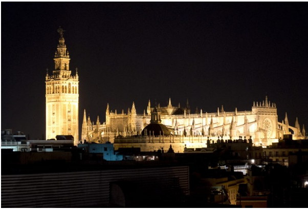
Seville at night