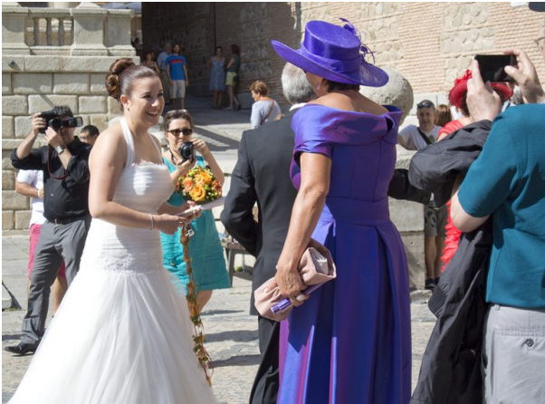
Toledo: Wedding party