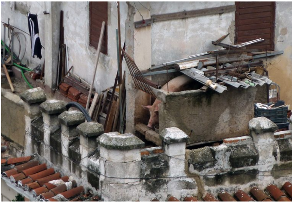
Pig on a roof