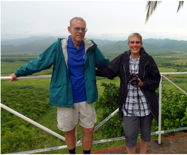
Sugar cane plantation