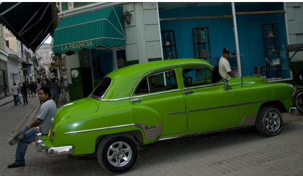
Lime green car