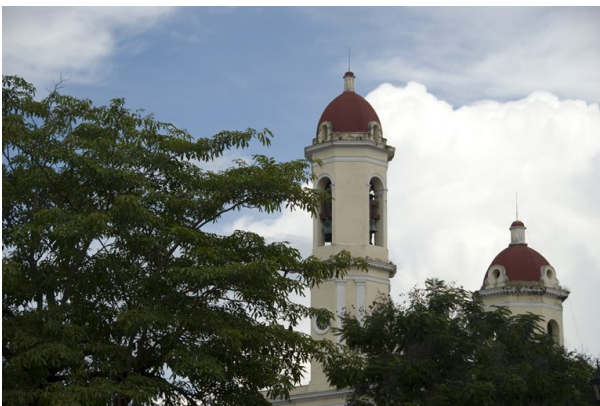
Tower in Cienfuegos

We traveled by bus to Cienfuegos and Trinidad, where we visited a rural village and a former sugar cane factory, and heard instrumental and vocal music programs.