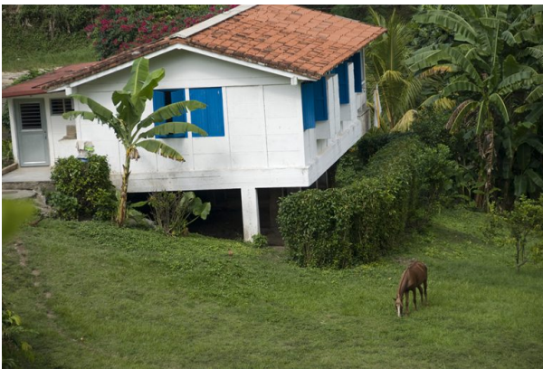
Las Terrazas house and horse

We traveled by bus to Cienfuegos and Trinidad, where we visited a rural village and a former sugar cane factory, and heard instrumental and vocal music programs.