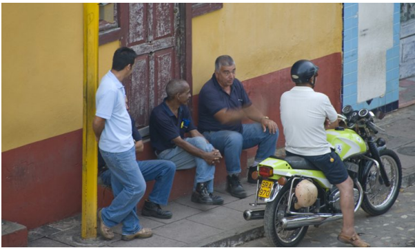
Street in Trinidad