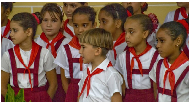
Children's choir in Trinidad