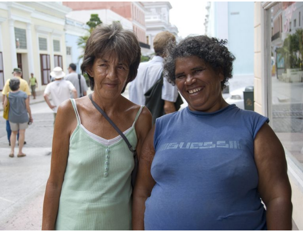
Women in Cienfuegos