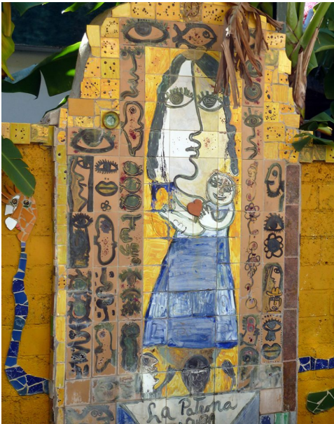
Art by José Fuster