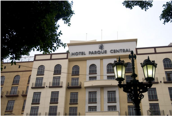
Hotel Parque Central in Havana

the Las Terrazas community, which is west of Havana.