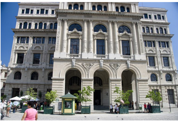
Restored building in Havana