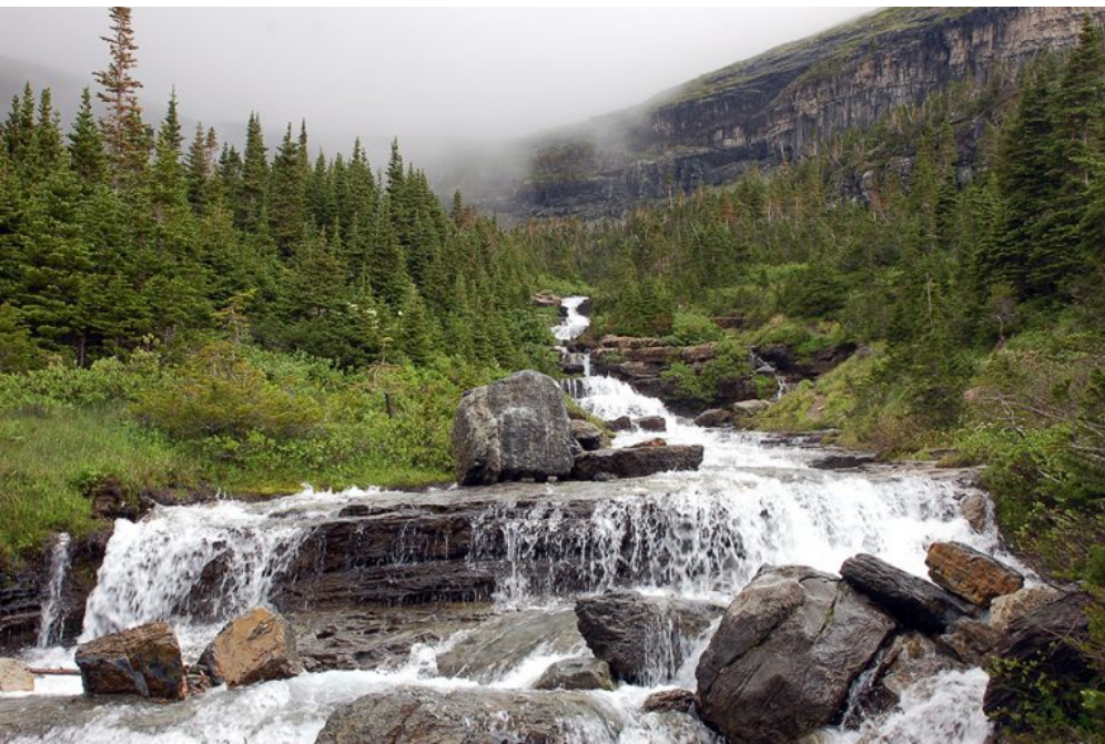
Glacier National Park