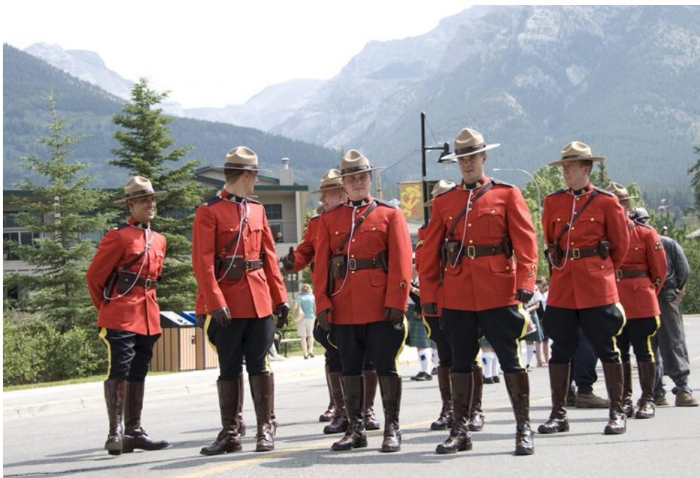
Miners' Day parade in Canmore