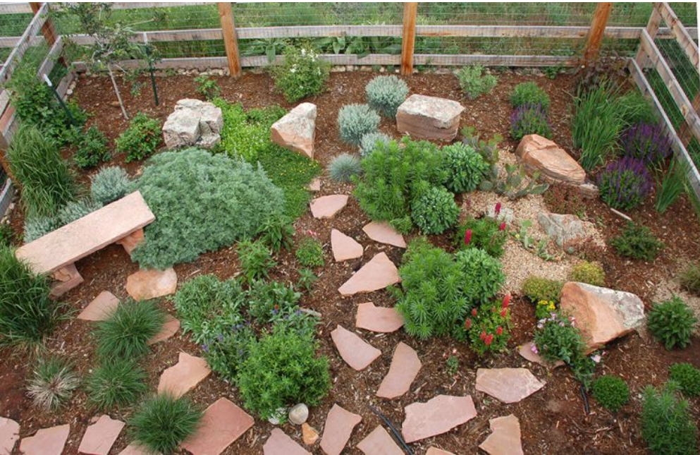
Our Colorado garden

One of the last photos I took in Lyons was of this sign at the local nursery. What IS a “four one lane bridge,” anyway?!