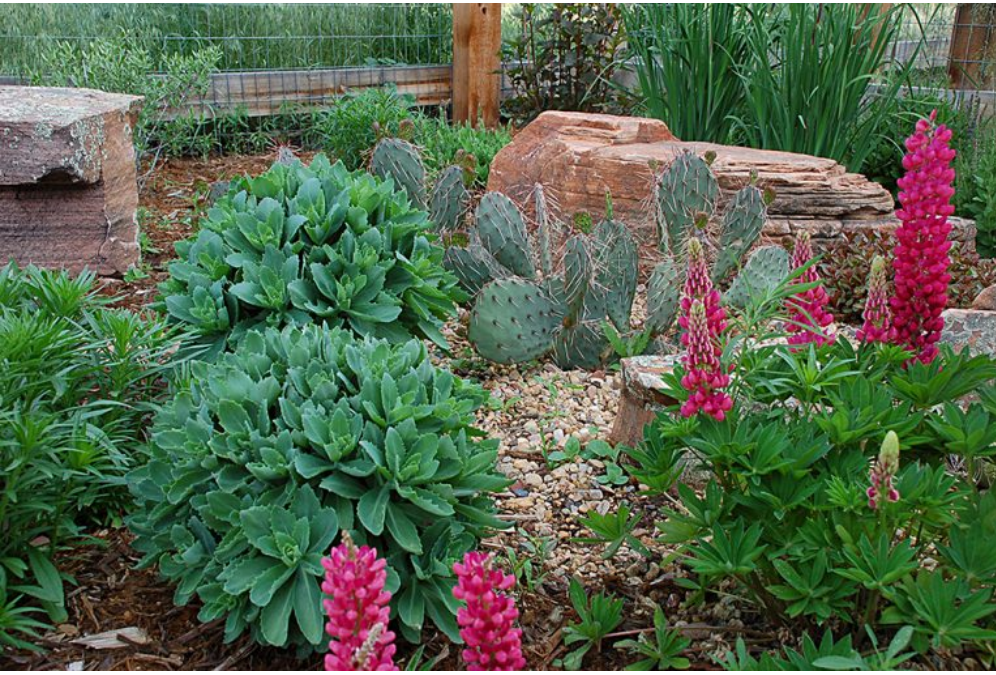
Our Colorado garden

We tried to keep the loads light in our vehicles, but we HAD to bring along four of our beloved house plants that had been with us for years, and which had been purchased in California. We were a little worried: Would the Canadian border authorities take them away? Could we get them back into the U.S.? What would happen when we reached the California border? (California is one of the few states with a border patrol devoted almost exclusively to taking away fruit and plants!)