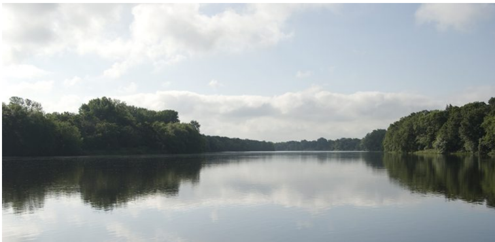
Mississippi River near Monticello MN

When we arrived in the Minneapolis area, we parked our RV in a campground along the Mississippi in Monticello, just northwest of Rogers.