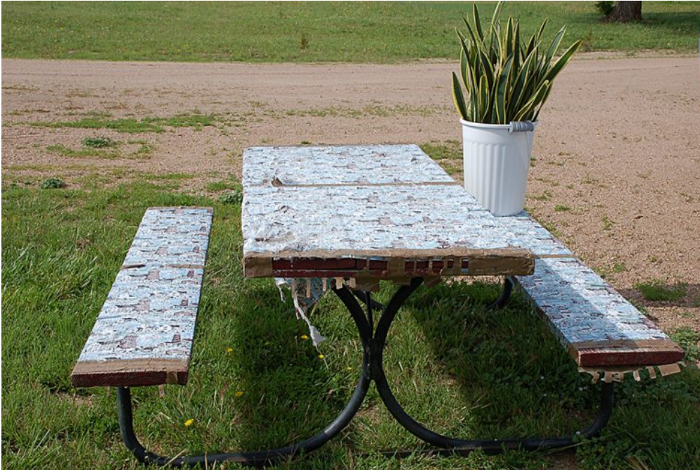
One of our "pet" houseplants in Nebraska City NE

who said OK. I was severely warned, though, that I should NEVER BRING HOUSEPLANTS INTO THE U.S. AGAIN! Don't worry . . .