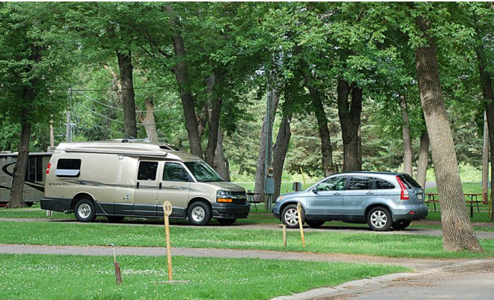
Our "trek" vehicles: Maggie II and Bluebird