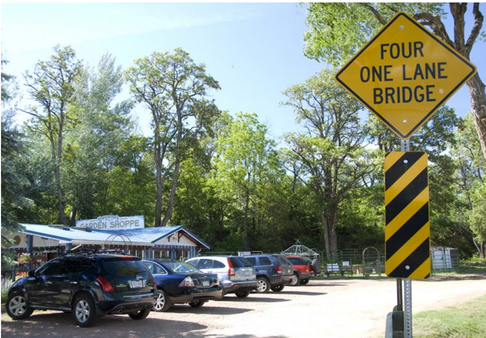
Sign in Lyons CO

One of the last photos I took in Lyons was of this sign at the local nursery. What IS a “four one lane bridge,” anyway?!