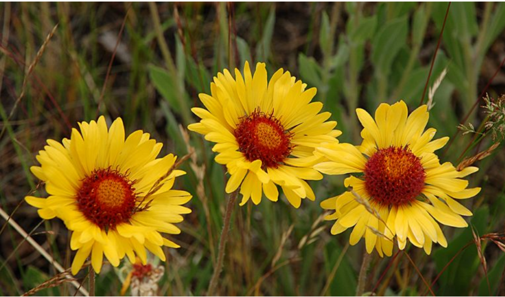
Glacier National Park

We needed to put in more time on our workshop, so on the 16th we headed for Missoula, where we worked for five days. Although the weather was hot and smoggy, we also enjoyed some sightseeing in the Missoula area: Missoula Carrousel, University of Montana, and Fort Missoula. We ate twice in a grocery with a soup and salad bar (our favorite dinner!) and a Famous Dave's, which always reminds us of good times in Minnesota. In the KOA RV park we met a couple from the UK who had bought a Roadtrek a couple of years ago and now drove it around the U.S. for just short of 3 months (the limit for a visitor visa), parked and stored it, flew back home for a couple of weeks, and then started again where they had left off in their U.S. odyssey. They had already seen much more of the country than most Americans.