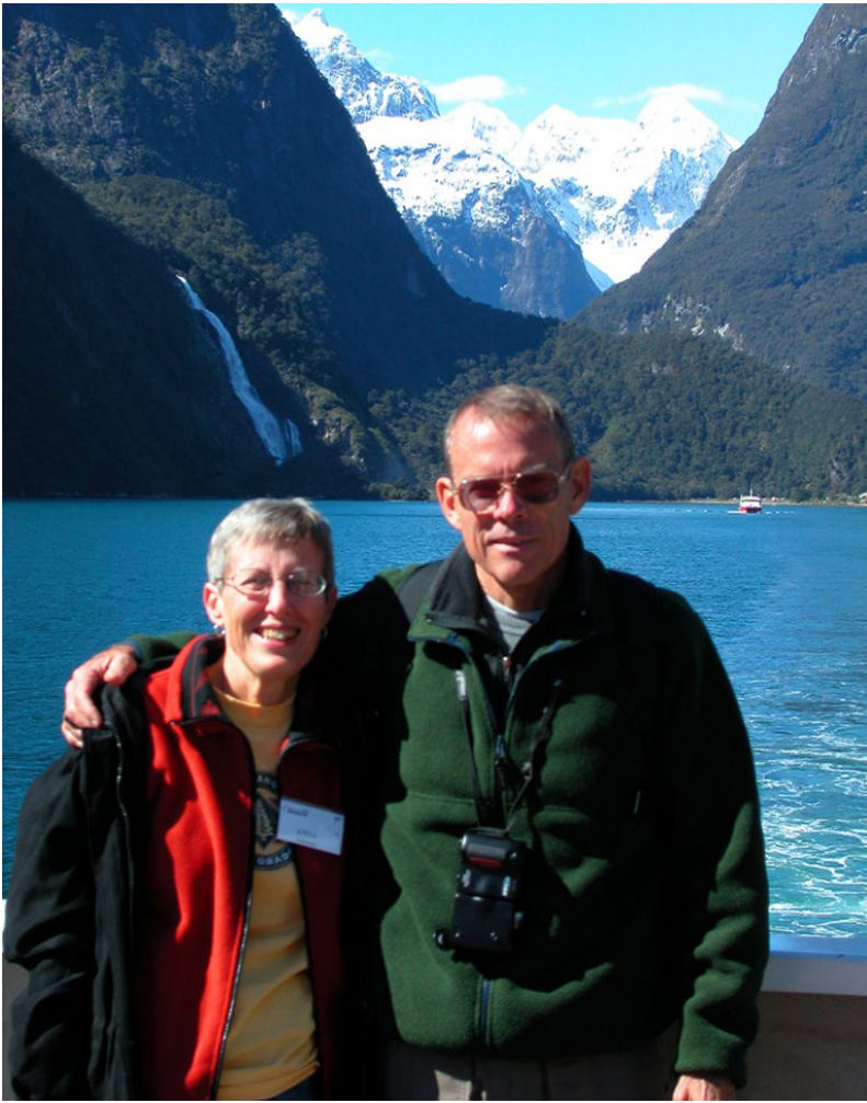
Milford Sound, New Zealand