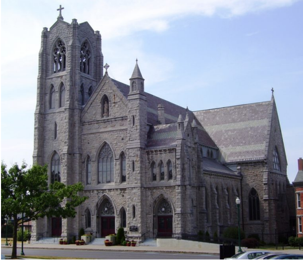
St. Mary's Roman Catholic Church, Auburn, NY