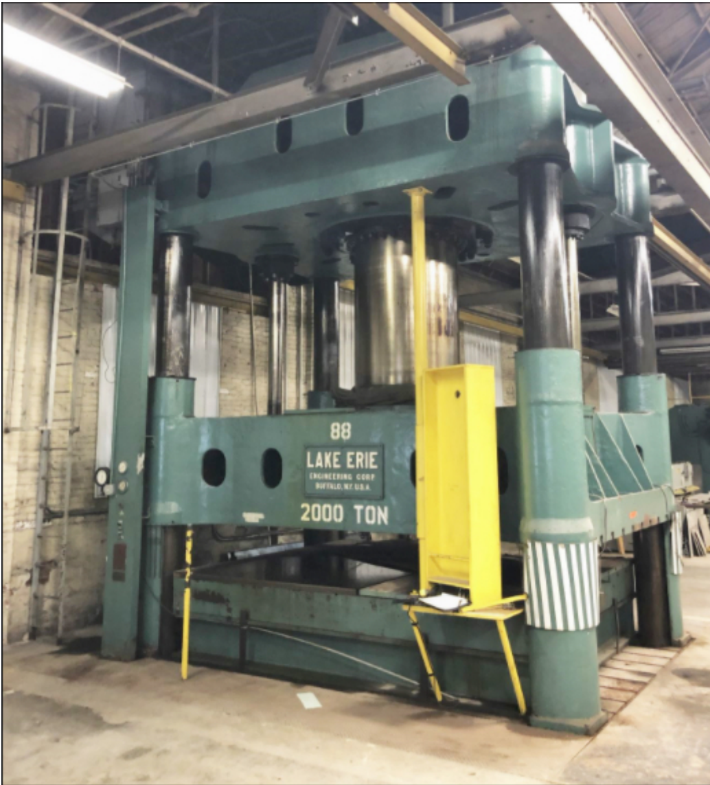
Lake Erie Hydraulic Press