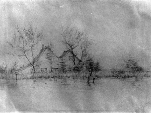
Sketch by Jan Sluyters