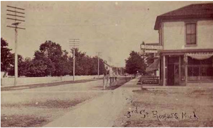
Rogers, MI Post Office, Third Street (1910) (Presque Isle County) Originally Rogers City, name changed to Rogers on January 22, 1895. Name changed back to Rogers City on January 28, 1928.